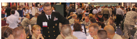
Exhibit Hall Opening – $10,000

The Welcome Reception serves as the JFPS 2024 “kick off” for all attendees, and provides an informal atmosphere to mix and mingle with attendees and industry partners. Entertainment, appetizers, and nonalcoholic beverages are provided (cash bar available).